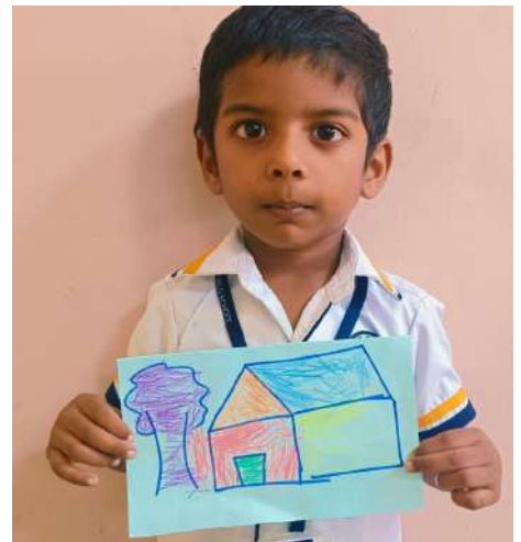
ATHIF ALEEM - K2 LITCHI